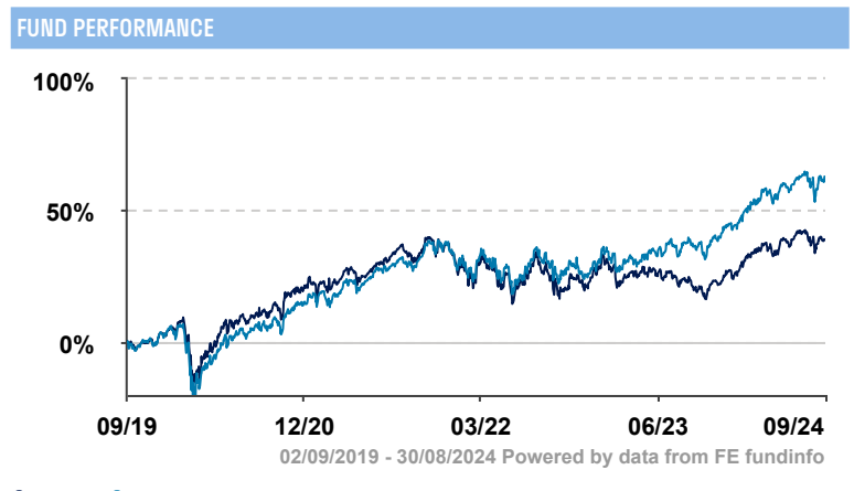
Fund 🔍 Benchmark